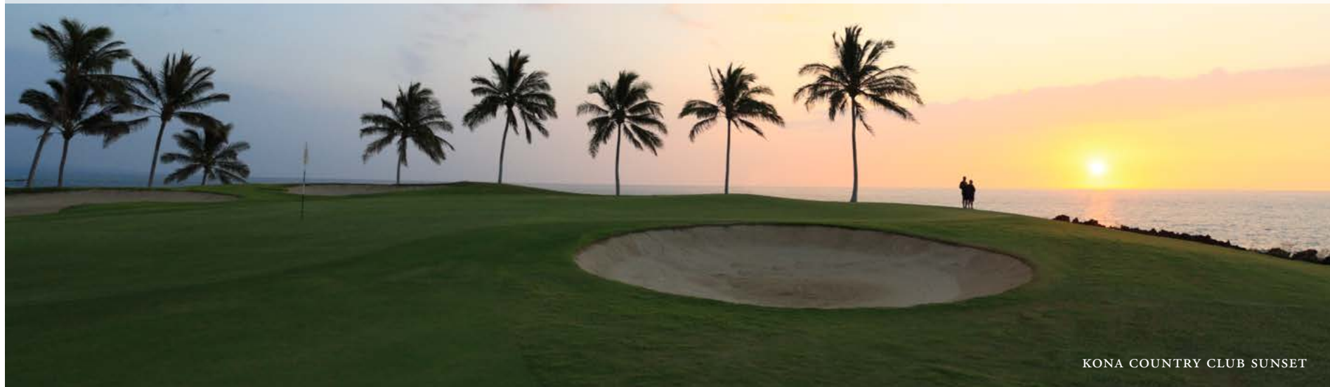
KONA COUNTRY CLUB SUNSET

DISCOVER YOUR “NEW BEGINNING” IN A REMARKABLE LOCATION