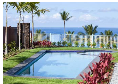
PRIVATE POOL & SPA

EXPLORE Enjoy excellent shopping and dining options in the Keauhou Shopping Center.