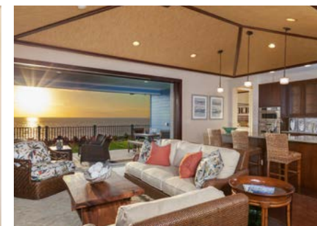
INDOOR / OUTDOOR LIVING